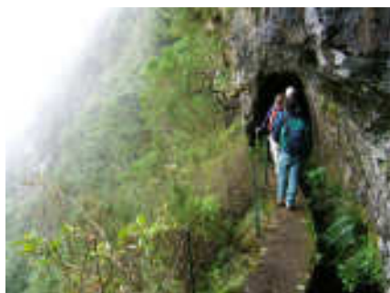
Below – going into a tunnel in the cliff.