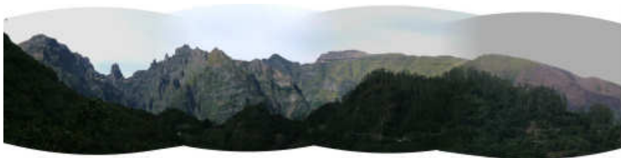
Above – view of the mountains at the centre of the island.