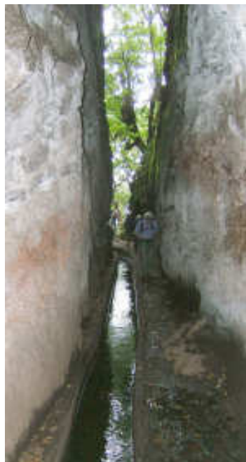
Left – Terry going through a cutting.