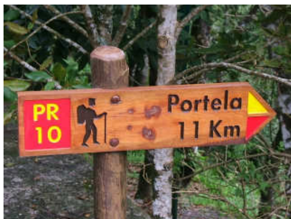
Below – walking along the Levada Do Furado