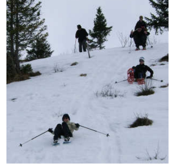
Above – The top. View of the higher peaks behind Le Truc. Tobogganing! Below – admiring the view & snow showing across the plateau.