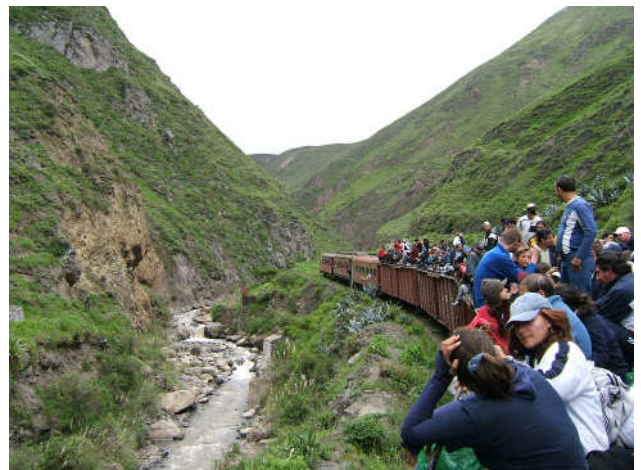
where the line zigzags down the side of the mountain