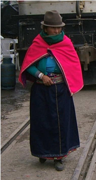
Left – local woman in traditional dress