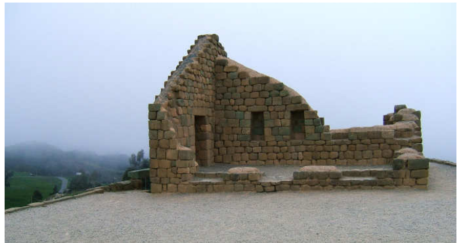
The Sun Temple