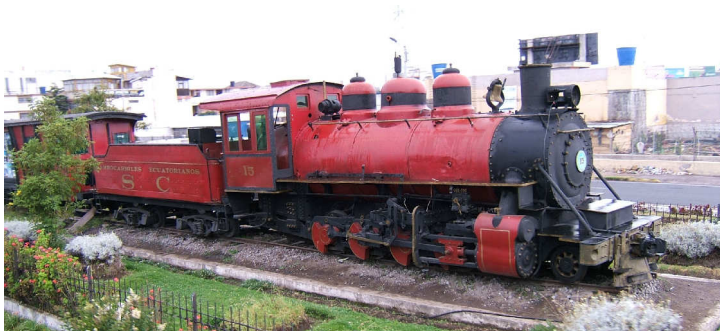
One of the original steam trains is on display as you pull out of Riobamba Below - Two of the local kids