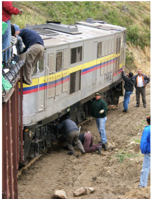
Below right - The second derailment just outside Alausi