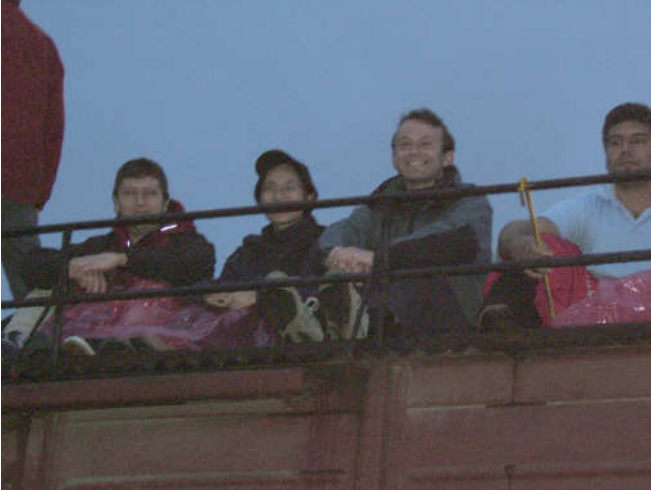
Above - Bagging our seat on the train roof at an unearthly hour in the morning Right – On the train roof at Riobamba station