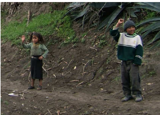
Right – The railway runs straight through the middle of the market in the main street of Guamote Below - Guamote