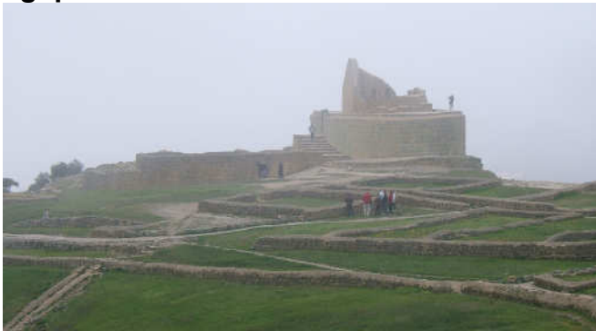
View across the site to the Sun Temple Right – In front of the Sun Temple