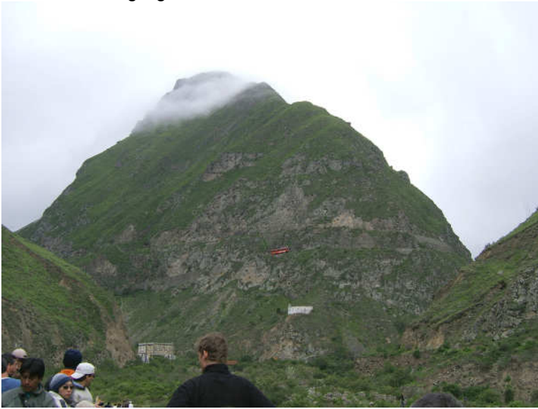
Right and below – views of the Nariz del Diabolo, where the line zigzags down the side of the mountain.