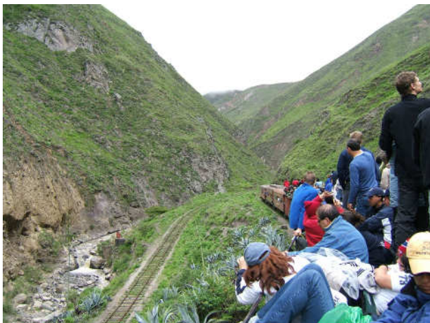
Above – views of the Nariz del Diabolo,