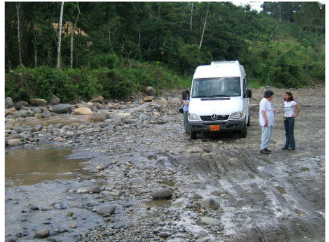
Driving up river (literally), to avoid a roadblock