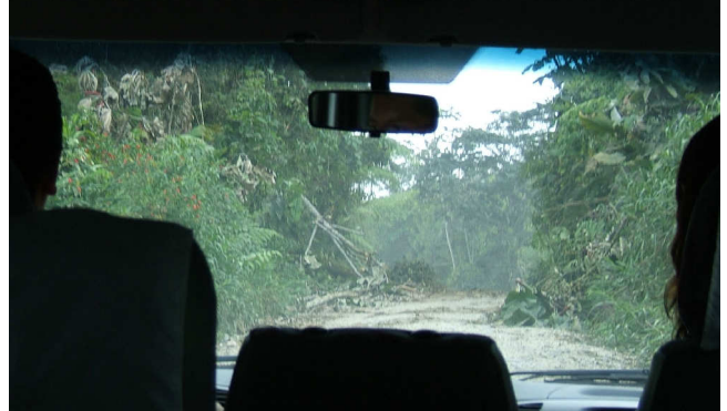
One of the felled tree roadblocks left by the protesting locals