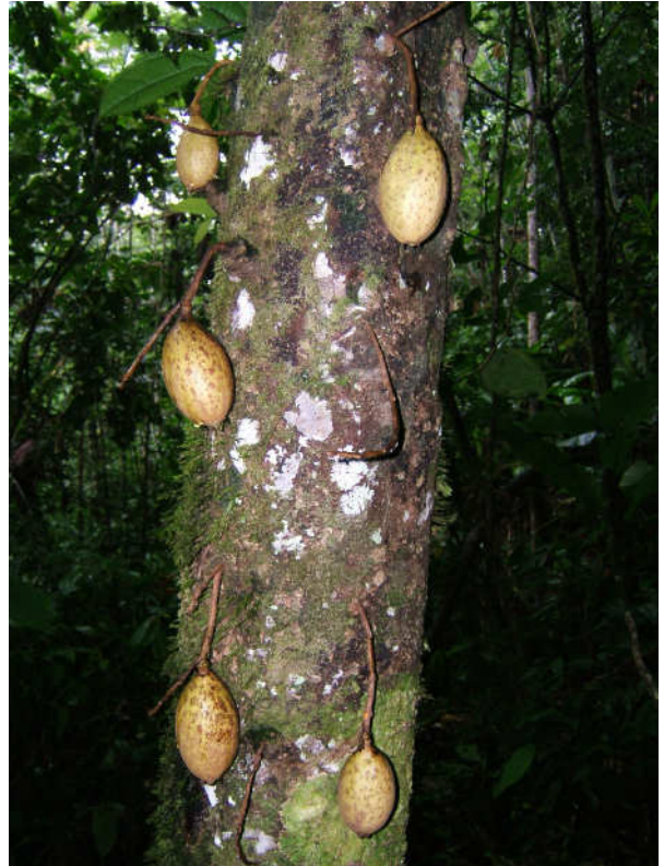
Fruits growing out of the tree trunk