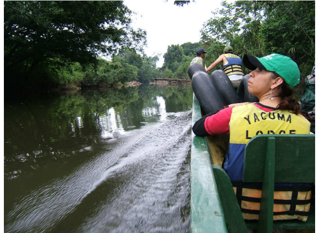
Heading upriver to the Lodge