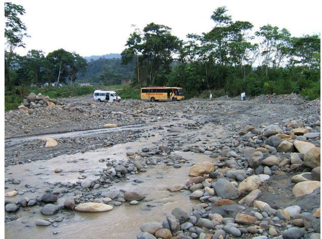
Heading up the river