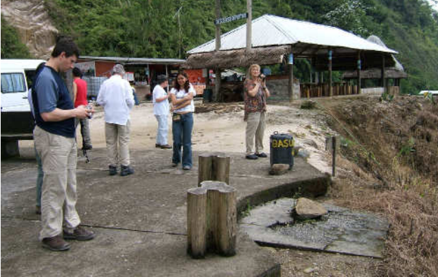
Stopping to admire the view