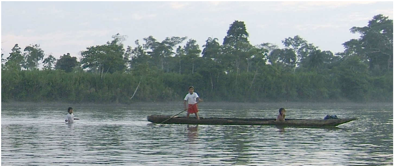
25 th February – Yacuma Lodge