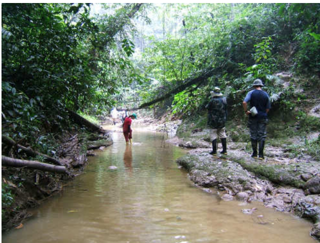
On the jungle walk