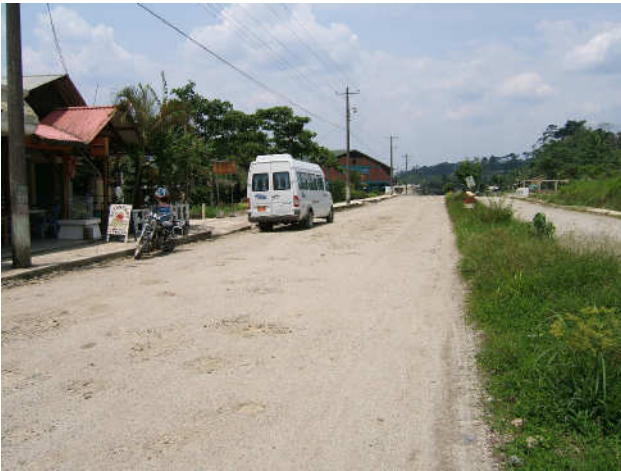
Main street in Santa Clara