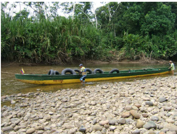
Getting the boat through the rapids