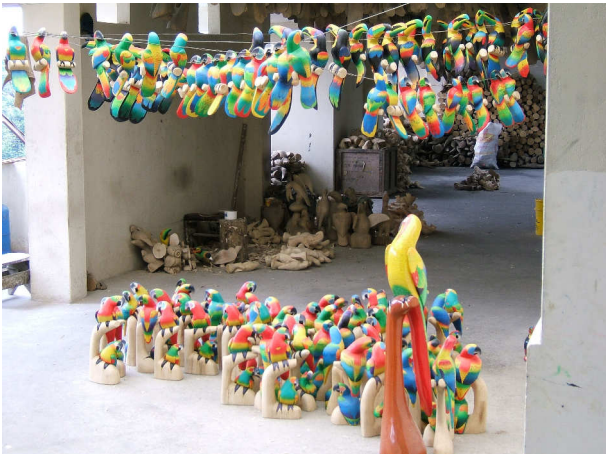
Factory making Balsa wood figures