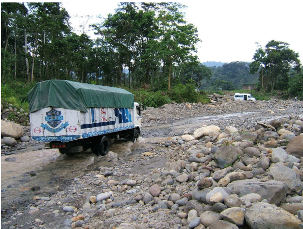
Driving up the river