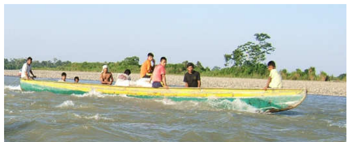
Above – river transport