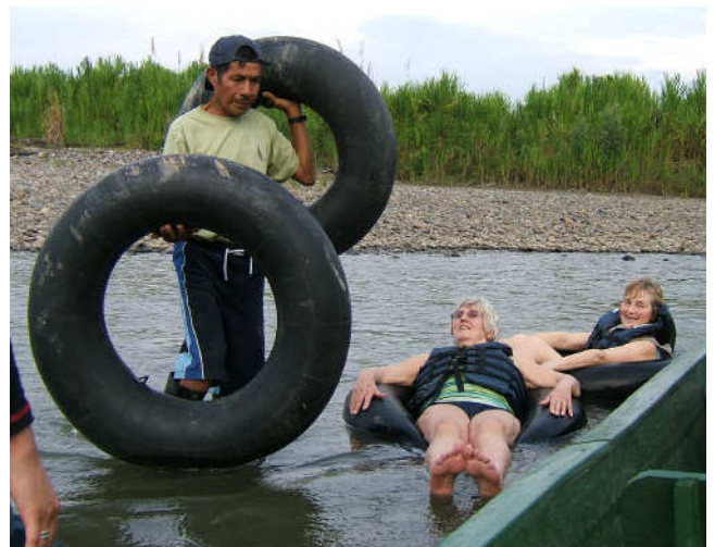
Floating off down river.