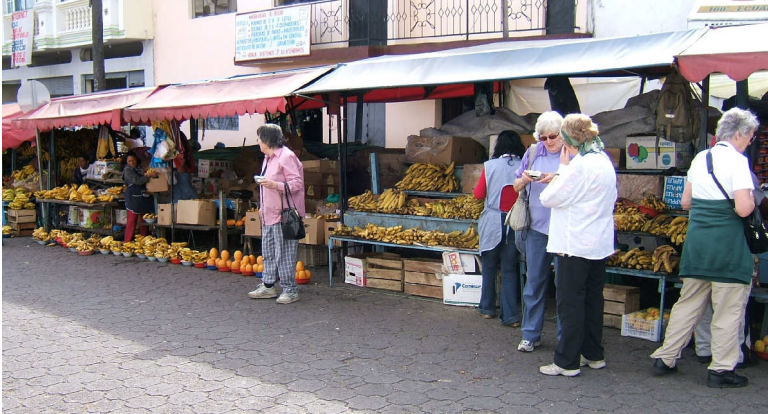
Fruit & veg market in Otavalo