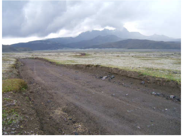
View towards Cotopaxi