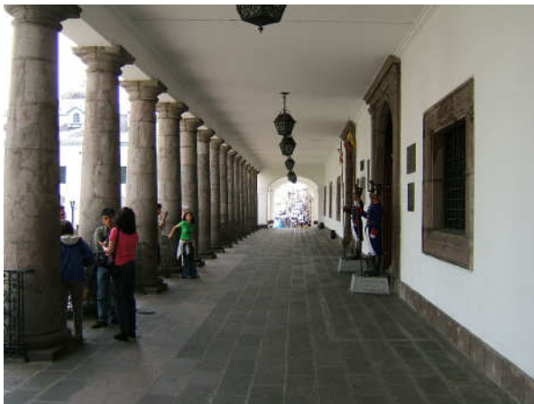
The Presidential Palace