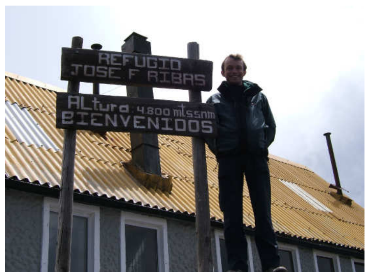
Left – wolf Above – proof that I made it to 4800m