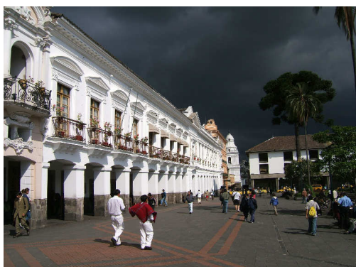
Left – bishop's palace on the edge of the main square