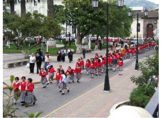
School children out on parade to try and convince the local council to pedestrianise the street outside their school