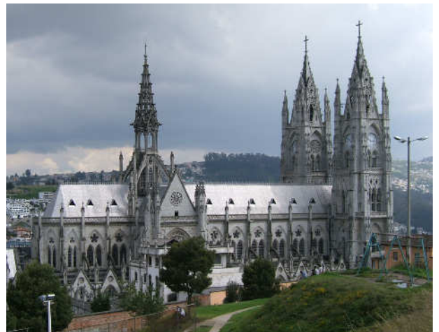
The basilica in Quito