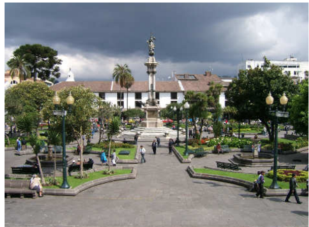
View out over the main square from the Presidential Palace