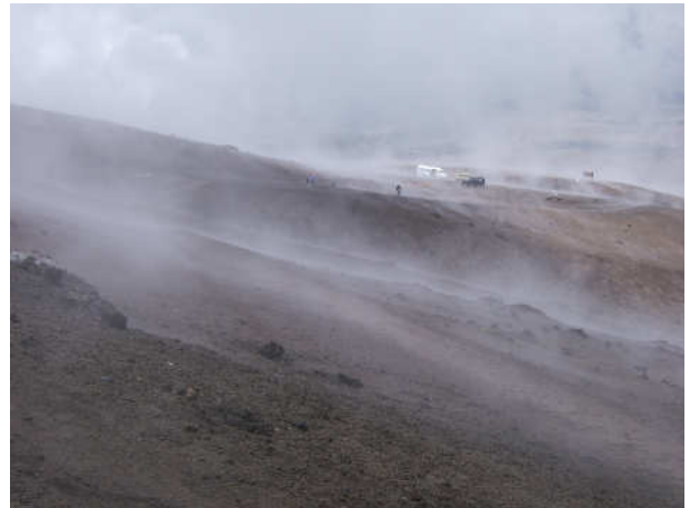
The slopes starting to steam as the sun comes out