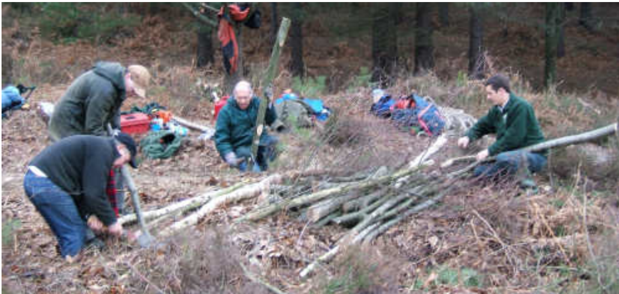
Padworth Common – 3 rd February