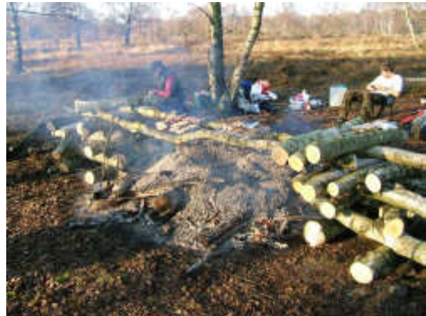
Above – tea break. Right – The industrial BBQ. Below left – one of the cows that came to investigate. Below right – BBQ

This was a joint task with the Greenham and Crookham Conservation volunteers. We were clearing birch scrub on the heathland area to the south of where the west end of the runway used to be. After we had got a big enough pile of ash from burning the brashings, an industrial scale barbeque was built out of birch logs, and burgers, sausages, and hot mince pies provided the perfect end to a nice day.