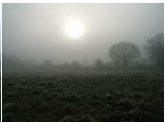
Top – Rodney feeding the fire. Above – We were greeted by a very foggy day.