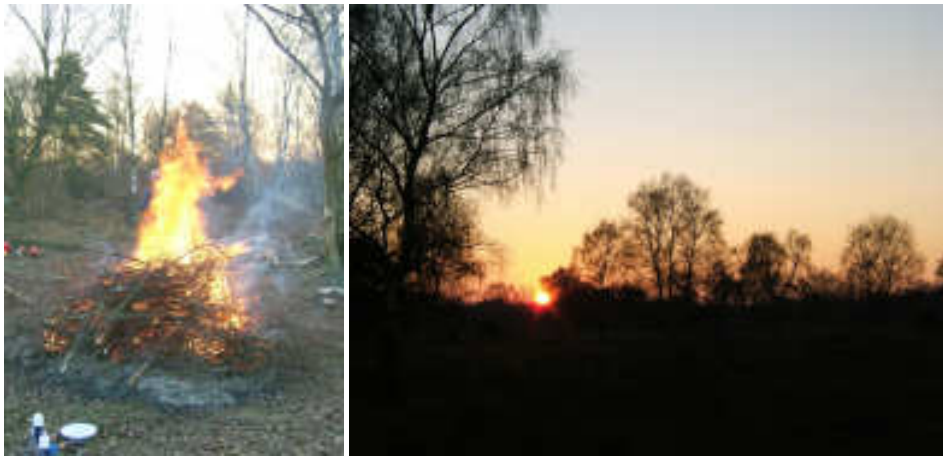
Above left – the bonfire after it was stoked up again post BBQ. Above right – Greenham sunset.