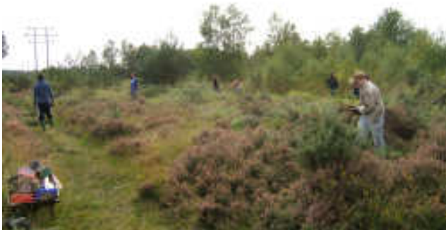
Above – this area was covered with scrub at the start of the task. You can see the impact many pairs of hands can make.

We were working on the southern half of the site, adjacent to where we've worked previously. Gorse and birch scrub has been invading the heathland over the last few years, and we were working to reverse the trend. There were a total of seventeen volunteers out on task today from at least five different nationalities, including our first ever Russian and Chinese volunteers. Lots of pairs of hands made light work of the birch and gorse scrub, and judging by the size of the piles we made a big impact.