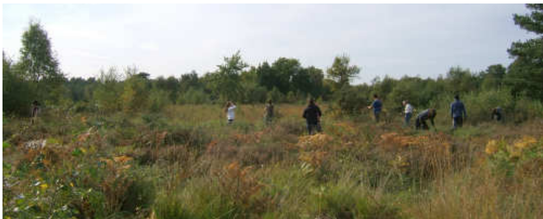
Above – clearing scrub at Padworth.

We were working on the southern half of the site, adjacent to where we've worked previously. Gorse and birch scrub has been invading the heathland over the last few years, and we were working to reverse the trend. There were a total of seventeen volunteers out on task today from at least five different nationalities, including our first ever Russian and Chinese volunteers. Lots of pairs of hands made light work of the birch and gorse scrub, and judging by the size of the piles we made a big impact.