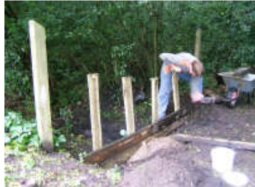
Above left – Phil digging out the ditch. Above right – Nigel nailing on the boards.

We had two construction jobs to do on this task at Englemere Pond. The first was on the entrance from the A329. The existing access path crosses a ditch as it comes in to the site. The side of the path had collapsed into the ditch, making access awkward. Our job was to dig out the side of the path, extend the existing drainage culvert, build a revetment and then backfill with hogging. The revetment was built with boards recycled from the old boardwalk at Wildmoor that we had replaced earlier in the year. Unfortunately the bag of hogging that had been delivered was not big enough, and we ran out. However, Carl remembered that there was an old abandoned path that used to run