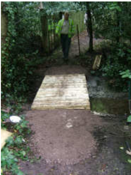
Left – Carl & the new footbridge.