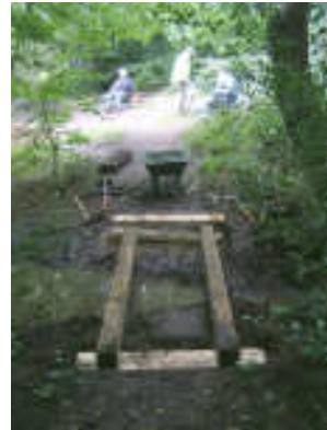
Above left – The almost finished revetment with the drainage culvert appearing at the bottom. The posts were trimmed later in the day. Above middle – the dismantled old bridge. Above right – the new bridge under construction, with everyone enjoying a well earned tea break in the background.