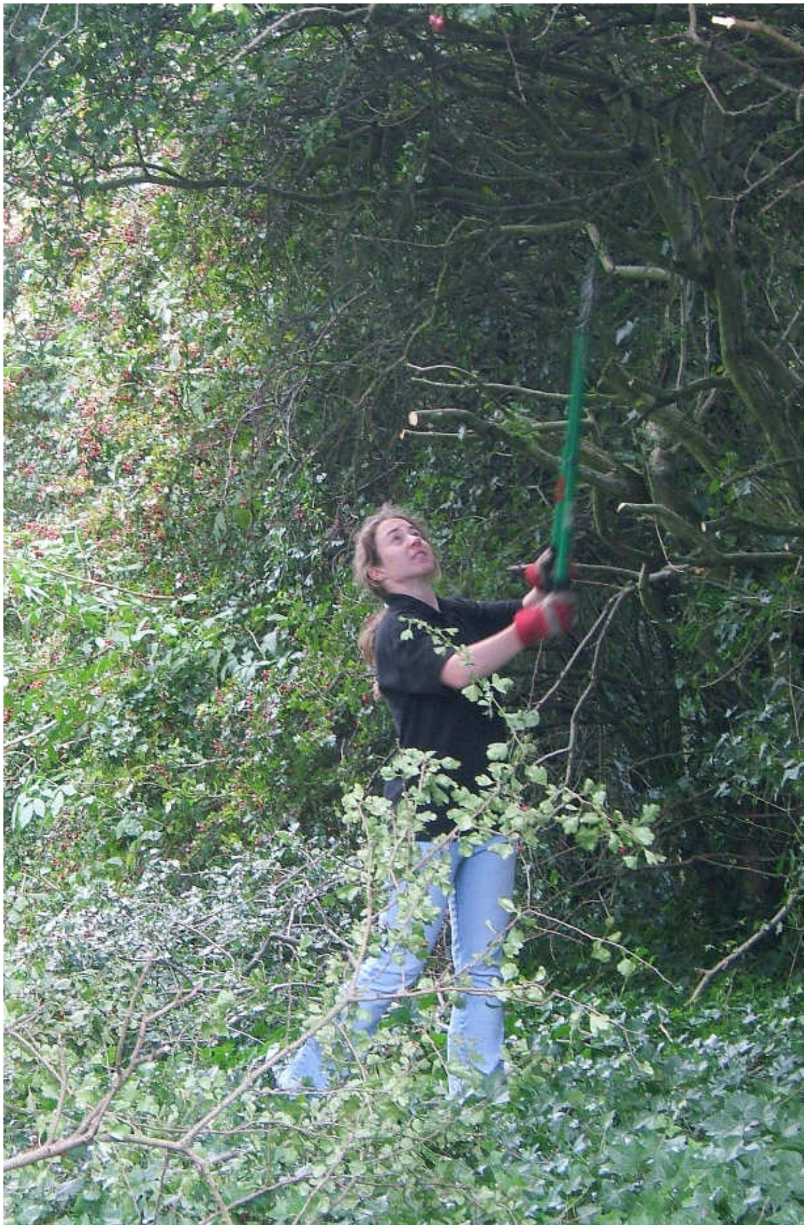
Longhill Park – 16 th September