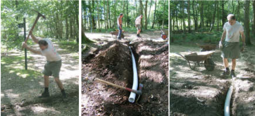
Above left – Phil digging the trench. Above middle – The drain pipe in place. Above right – Phil levelling out the gravel back fill.

this had become a bit of a stream, and the water flowing down it had washed away a lot of the hogging surface. We spent the day resurfacing this section of path, and installing two French drains across the path to divert any future rainfall away from the path to prevent a recurrence of the