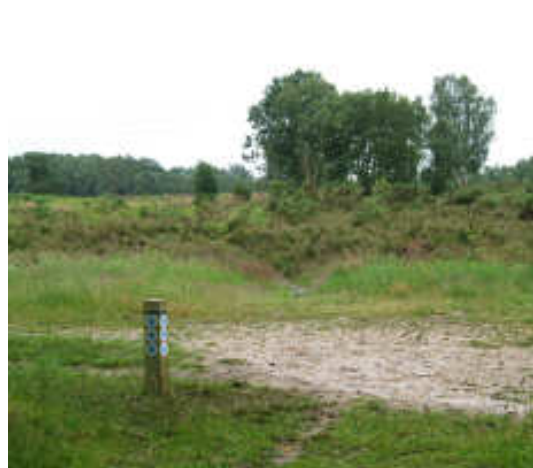
Above & Left – installed waymarking posts.

We were supposed to have been resurfacing a section of bridleway today, but due to the weather forecast, the materials had not been delivered to the site. This actually worked in our favour, as the horrible weather forecast meant that not many people turned up, so we probably wouldn't have got the path finished in time. Instead, Vicky got us to install some of the 40 or so waymarking posts that she has got