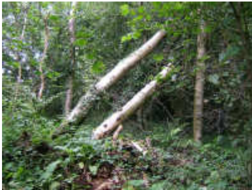
The hung up tree

Today's task fell into two halves. Firstly, some of the recent bad weather had left a silver birch tree dangerously hung up over the main path. A bit of chainsaw work and use of the winch made this safe. The second task was barrowing woodchip from a large pile by the entrance to resurface the path that