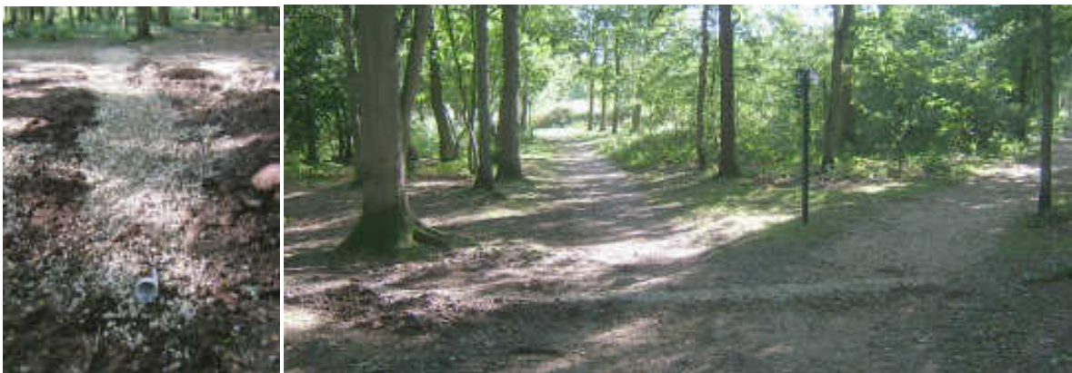
Above the finished French drain.

A perforated pipe was then installed in the bottom of the trench, and the trench backfilled with shingle that would allow any water to percolate through into the pipe which then discharged into an adjacent seasonal pond. Funniest moment was watching a Dachshund trying to jump the trench. Quite hard when you've only got short legs! We also had to dodge the hornets that seemed to have taken a liking to the tree next to where we were working.