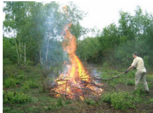
Right – David tending the fire. Above – Andy adding brushings to the fire

This part of the common is managed to provide birch for the steeplechase at Newbury racecourse. There are a succession of compartments that are harvested after three years. The densely packed young birch makes good nesting grounds for nightingales and the older harvested sections provide habitat for nightjars to go hunting for insects. We were clearing the site of the remains of the felled birch. The large trunks were stacked and everything else was burnt on a bonfire.