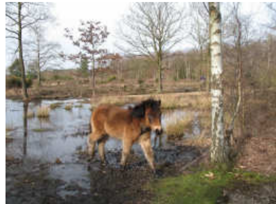
One of the ponies

Two consecutive second Sundays of the month spent scrub clearing with the local group. Both times we had good weather, a good turn out bolstered by a local scout troop who took on dragging duties, and a bonfire with baked potatoes and parsnips kindly provided by Keith the ranger. To try and