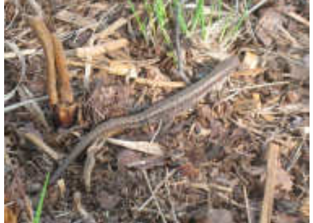
Above left – view across the site. Above right – one of the lizards seen running around where we were working. Below left & middle – assembling the new boardwalk. Below right – Richard doing some chainsaw carpentry.