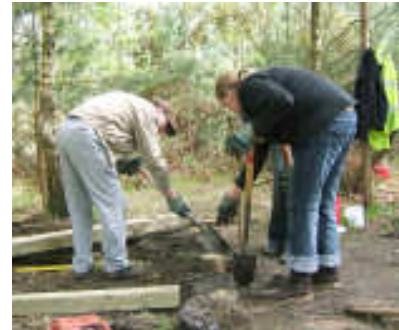
How many people does it take to install a new post?

in damp ground do have a finite lifespan, and after 12 years, these had rotted to the point where the boardwalk was beginning to give way. Our job for the day was to dismantle the end section of the boardwalk, dig in new support posts and then rebuild the boardwalk on top. The old boardwalk was dismantled fairly quickly, although it took a while to take