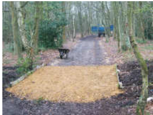
7) Add a layer of hogging to finish off

After a bit of confusion over phone numbers, I finally managed to confirm the task with Vicky at about 9pm on the Saturday night! The task was probably the last one resurfacing this stretch of bridleway, as the worst of the mud has now been removed. The task was to extend two of the existing resurfaced stretches. With all our previous practice we got to work like a well-oiled machine. The edging boards were staked in place, brash was cut to act as a base, then a layer of gravel to provide a well drained mid layer, all finished off with a layer of hogging. All in all a good task despite the intermittent light drizzle. We adjourned to the pub just up the road to finish things off properly!