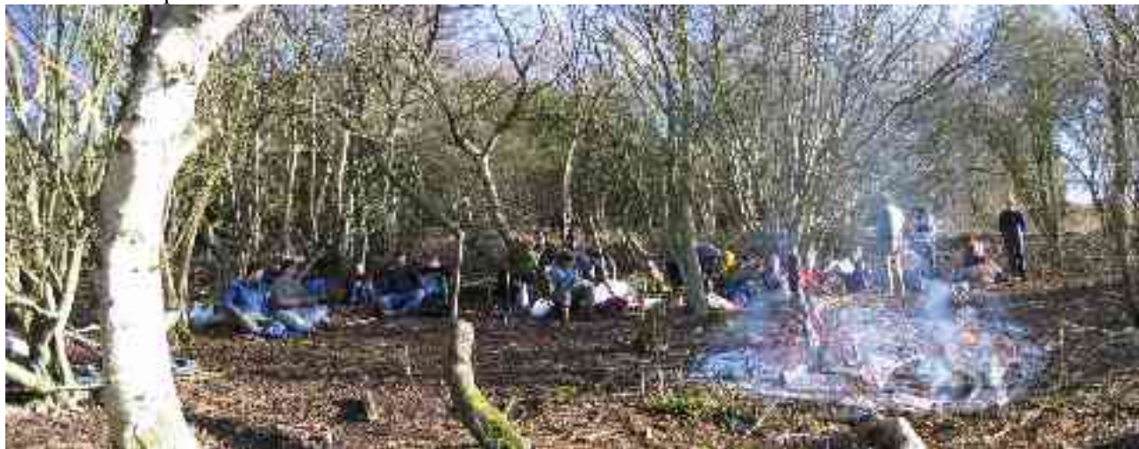
Above – tea break. Below – guided walk around the site.

Here are some pictures from Sunday's task, which was to clear hazel and birch re-growth and build dormouse friendly habitat. The scrub clearance should also help encourage the rare and temperamental juniper bushes that are a feature of this site. After lunch we were given a guided walk around this part of the site, which included a sunken way, a red kite sighting and a stroll through orchid rich pasture - although there were no flowers at this time of year. Most of the brash was burnt on a bonfire, which was also used to bake some lunchtime turnips